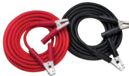
No. 422252 - 2/0 Gauge, 25' Length