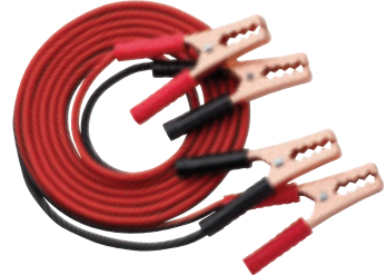
No. 410122 - 10 Gauge, 12' Length