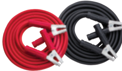
No. 401252 -1 Gauge, 25' Length