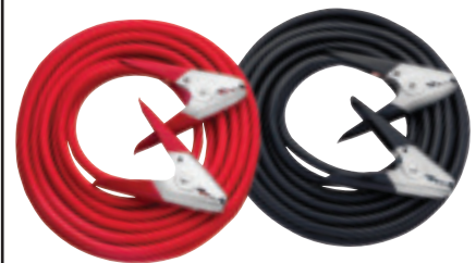
No. 402252 - 2 Gauge, 25' Length